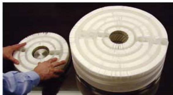
32 and 50 cm Platinum Filters

A doubling in the effective surface area means up to a four-fold increase in solids filtration capacity. This is the basis of the unique FTC "Platinum" high flow filtration system. All the components in this high temperature element can be incinerated.