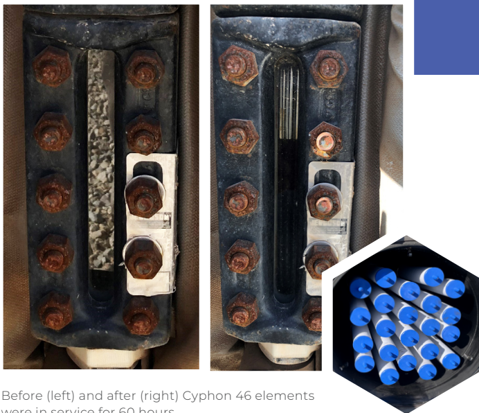
Before (left) and after (right) Cyphon 46 elements were in service for 60 hours.

Measurable liquids were almost immediately seen in the first and second stage sight glasses after the Cyphon 46 elements were installed.